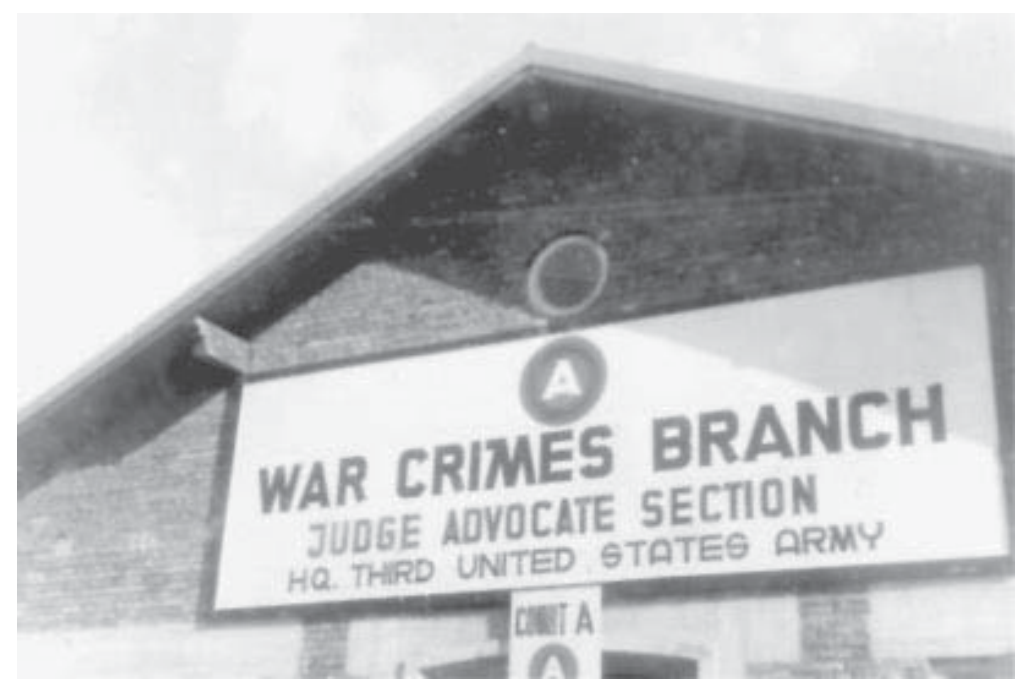
Entrance to the main courtroom at Dachau concentration camp.