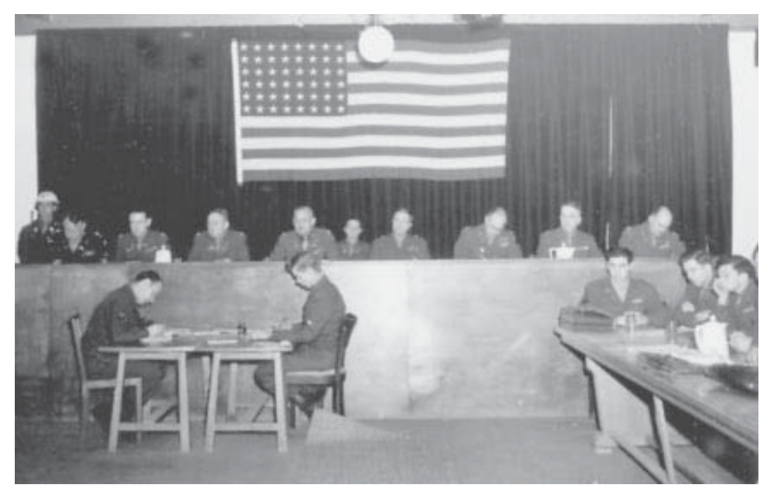
The court, showing reporters (left) and the defense table (right).